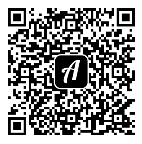
Bound: Ein wundervoller Rundgang durch die Paul Fleming Oberschule Hartenstein